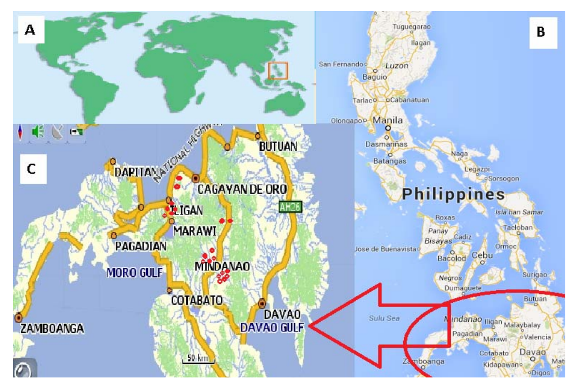
Figure 1. Map of the world (A) (www.marloncabilan.wordpress.com 2012) and the Philippines (B) (www.google.com.ph/maps 2015) showing the location of 19 caves (red dots) (C) (www.car-navi.ph 2010).